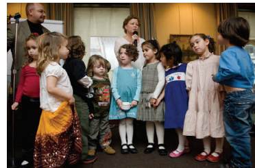
Students from the Claremont Children's School on stage to receive the Book for Kids Kids Helping Kids award.